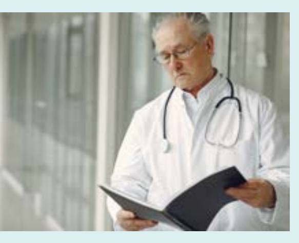
in Medicare during the three (3) months prior to your 65th birthday, you can ensure your continuous eligibility for a health

imely enrollment in Medicare is critical to maintain your health subsidy eligibility. Social Security Administration provides a seven-month window to enroll in Medicare, which includes the three (3) months before and after the month you turn 65. LAFPP recommends that you enroll in Medicare as soon as you are eligible. By enrolling